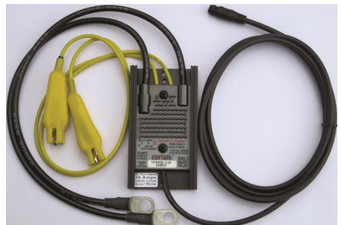
SRL1 on micro heatsink – A1506031501