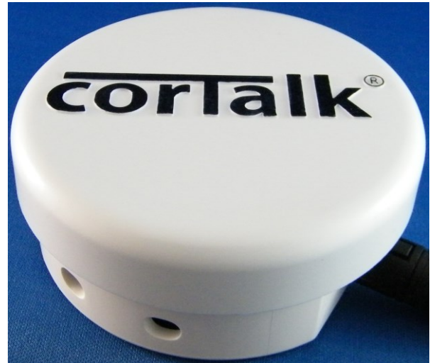
Top side view

A20A03UGI03 Programming kit for uGI1. Includes 3.2 ft (1 mtr) long USB cable and USB drive with PC configuration software.