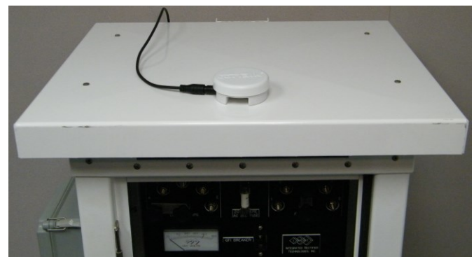
Mounted on rectifier cabinet