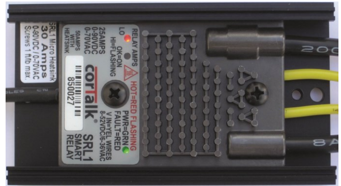
SRL1 on micro heatsink – 30 Amps 0-90VDC / 0-70VAC

The SRL1 smart relay is a low cost solid state interruption switch designed to operate with the uGI micro GPS current interrupter. This product combination is used to precisely interrupt cathodic protection rectifiers during corrosion field survey activities. The SRL1 continuously monitors the load current, synchronization status and relay temperature. The uGI produces a time stamped event log which includes the measured load current, relay temperature, switch status, interruption parameters, and geolocation information. The log also identifies fault conditions such as low load current, overload, over temperature, low supply voltage and loss of GPS sync.