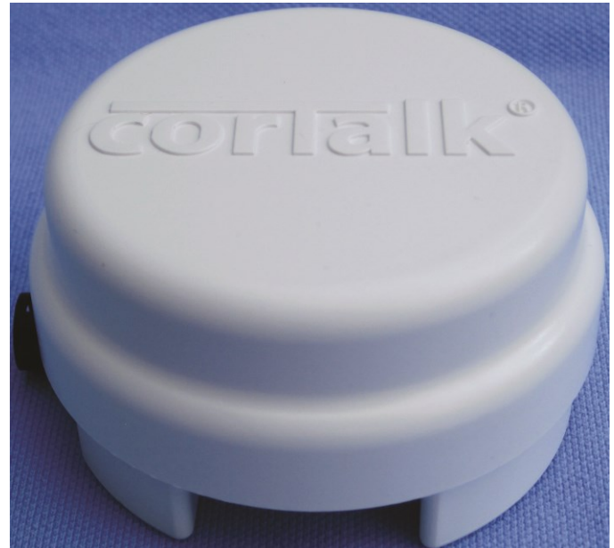
Top side view