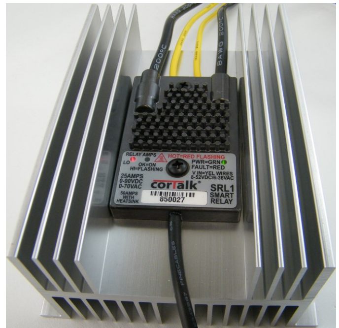
SRL1 on medium heatsink – 50 Amps 0-90VDC / 0-70VAC