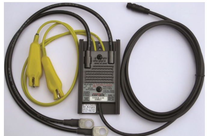
SRL1 on micro heatsink – A150603150

A20A0331902 uGI1S Advanced Micro GPS interrupter kit – c/w SRL1 smart relay. Includes: uGI1S Advanced Micro GPS Interrupter, SRL1 smart solid state relay on micro heatsink 30A (50A with optional medium heatsink) 0-90VDC 0-70VAC, & fabric carrying case c/w 1 year warranty.